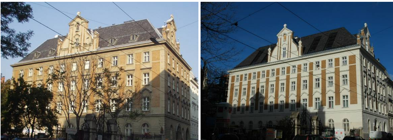
Square and Street view of Kaiser Street before and after reconstruction

In addition to the thermal reconstruction of the roof truss, yard façade and fireproof walls and the application of a central ventilation system with heat recovery and particularly the installation of interior insulation and complementation of the box-type windows to be sustained by applying inward lying wooden window frames that are suitable for passive houses, can be highlighted as innovative reconstruction measures.