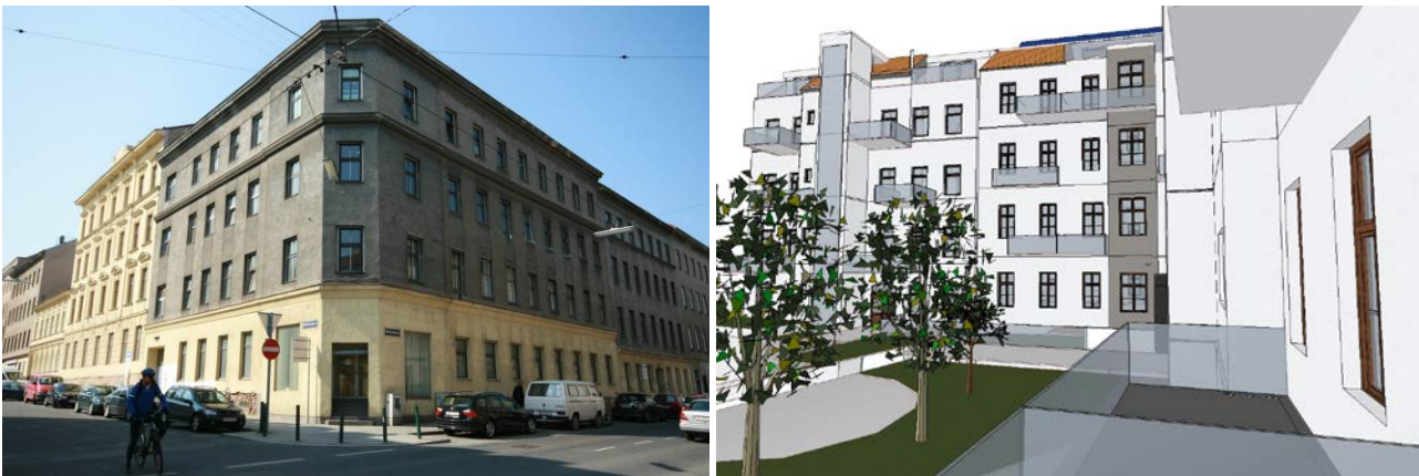
Ensemble David's Corner, Yard view in accordance with planned reconstruction

The ensemble of three buildings of the promoterism era in Vienna Favoriten forms the corner of a typical perimeter block development. But for a few exceptions, the 34 residential units were still in their original room-kitchen configuration. Altogether, the three buildings including the 5 business premises on the ground floor have a utility area of 2,350 m 2 . Two objects have a cleared façade, one object, a fully preserved segmented façade. The objects were in a state that strongly requires reconstruction (moisture, leaking roof, leaking windows etc.). With warehouse halls covering most of its area, the yard was in a desolate situation. The thermal heat requirement of the 3 objects before reconstruction was about 121 kWh/m 2 a, heat supply was realized through gas converters, while hot water preparation was realized through electrical storage heater in individual apartments. The buildings are owned by Condominium Immobilien. After a long planning phase, the project is being implemented by Bluewaters, the real estate trustee chancery Dirnbacher, Treberspurg & Partner Architekten and Imoplan ZT for building equipment and appliances. Completion is scheduled for 2014.